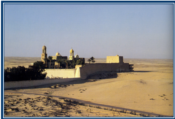
St. Mary (El-Sourian) Monastery, Scetis, Egypt

25+ days to Symposium: 75% Refund 14+ days to Symposium: 50% Refund 14 days or less to Symposium: No Refund